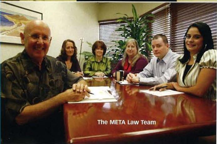
The META Law Team